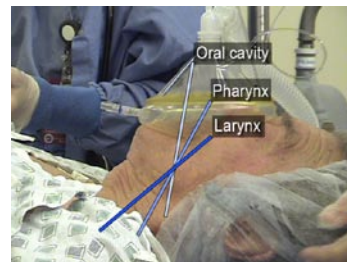
Figure 2. The "sniffing" position

In many cases, a neuromuscular-blocking agent and a potent sedative are needed to facilitate intubation. These agents will improve your visualization of the vocal cords and prevent the patient from vomiting and aspirating gastric contents. 3 If you plan